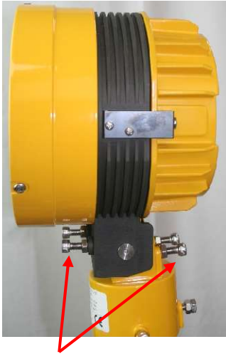
(Fig 2) DTS fitting