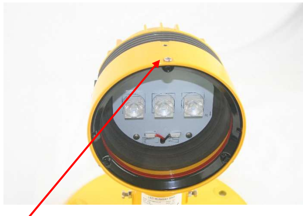
(Fig 3) align the brackets concaved area to this screw